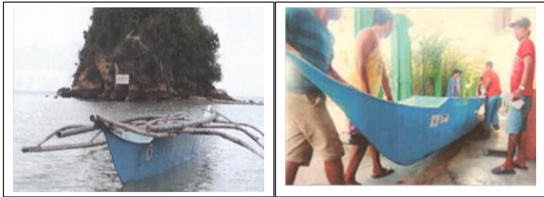
Fig. 4. Patrol boats granted/ provided for patrolling and regulation activities of the FLET