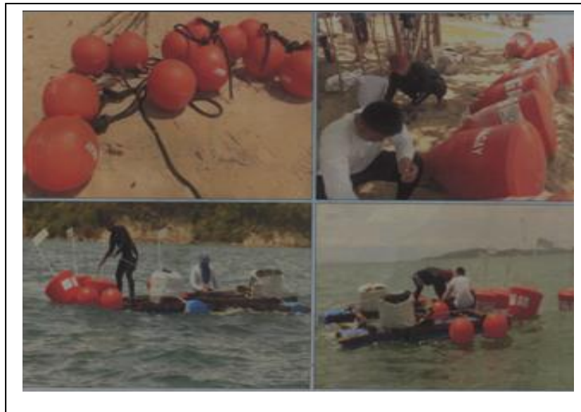
Fig. 2. The orange buoy markers installed in the Marine Reserve and Fish Sanctuary at Sitio Ogtoc, Barangay Buenasuerte

surveillance and regulation activities in the eight coastal barangays. Four (4) of these were from the local government while the other one was granted by BFAR under the FishCORAL Project. These boats are likewise provided with essential supplies for the patrolling activities. Maintenance and gasoline expenses are regularly provided by the local government to make these double engine patrol boats fully operational. However, the local government decided to designate one of these boats for activities related to tourism purposes.