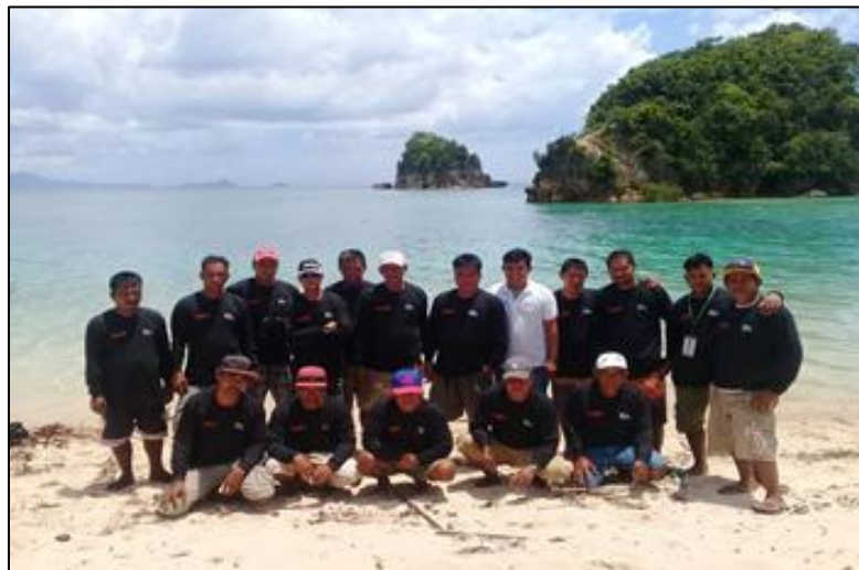
Fig. 5. The FLET members (bantay dagat) from the 8 coastal barangays