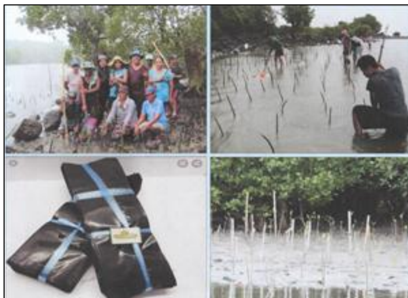
Fig. 6. Mangrove planting activities at Barangay San Rafael