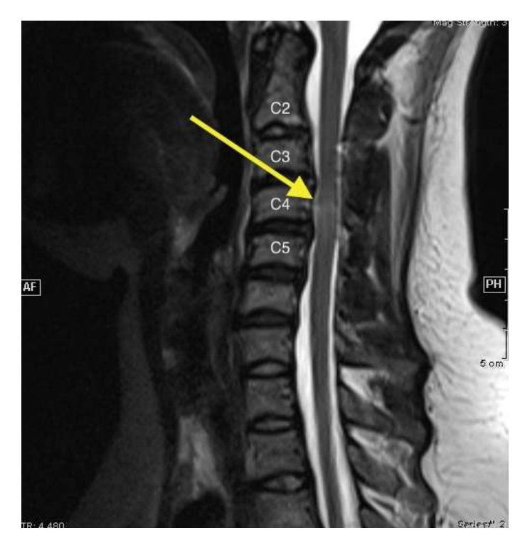
Fig. 1A. MRI of the cervical spine in sagittal view (T2 weighted), depicting multilevel degenerative disc disease with the yellow arrow depicting the hyperintense signal at the C4 vertebral level and spinal canal stenosis of 8 millimeters noted from C3-C5.