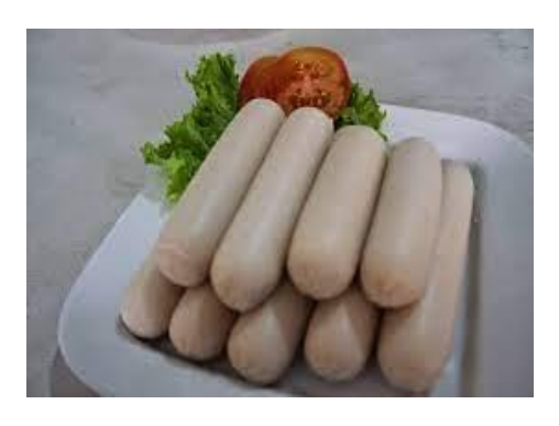
Fig 5. Fish Sausage

Fish sausage, an emulsion product of ground fish meat that is cured / salted, plus binder and oil and spices, is chewy with a uniform cylinder shape using a special wrapper, namely cassing.