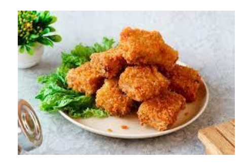
Fig 3. Fish Nugget Source: www.kompas.com [15]

Fish nuggets, fish nuggets or breaded fish are processed products from surimi / meat / fish fillets which undergo a battering and breading process.