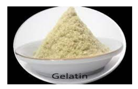
Fig 8. Gelatin Source: kkp.go.id [21]

Gelatin is a type of protein obtained from natural collagen found in skin and bones [20].