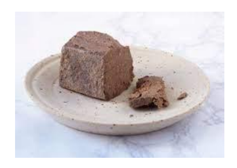
Fig 13. Shrimp paste