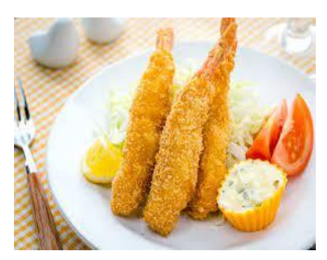
Fig 7. Panko Ebi

- Panko ebi, food made from shrimp and covered with panko flour and then frozen / fried in hot oil.