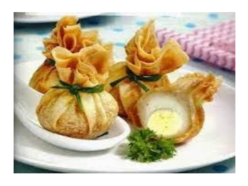
Fig 6. Ekado [18]

Fish ekado, a processed product made from surimi with the addition of flour and spices. The dough is wrapped in dumpling sheets and tied with chives.