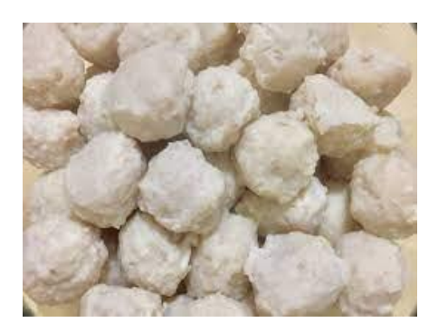
Fig. 4. Fish ball [16]

Fish sausage, an emulsion product of ground fish meat that is cured / salted, plus binder and oil and spices, is chewy with a uniform cylinder shape using a special wrapper, namely cassing.