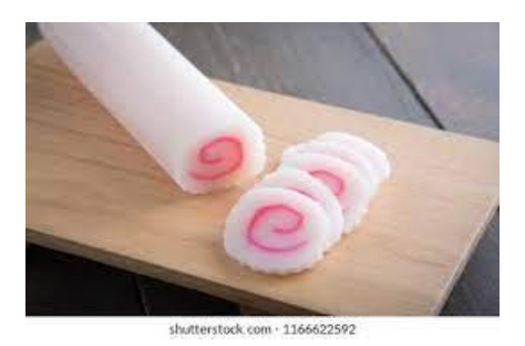
Fig 2. Kamaboko Source: www.shutterstock.com [14]

Kamaboko, a fish processed product made from surimi or crushed meat from Japan in the form of gel, is chewy and elastic [13].