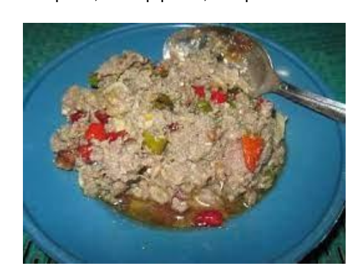
Fig 11. Bekasam

- Fermentation is a process of chemical change in an organic substrate through enzyme activity produced by microorganisms [30]. Examples of fermented products made from fishery processing are fish sauce, bekasam, peda, shrimp paste, fish paste.