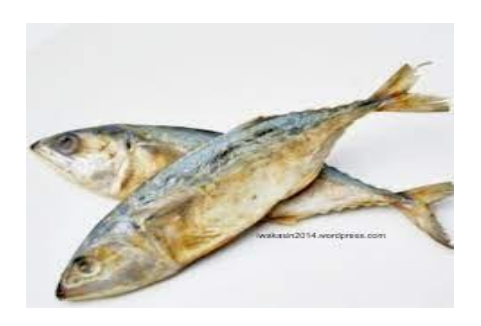
Fig 12. Peda [32]