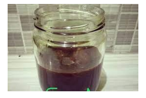
Fig 15. Fish Petis