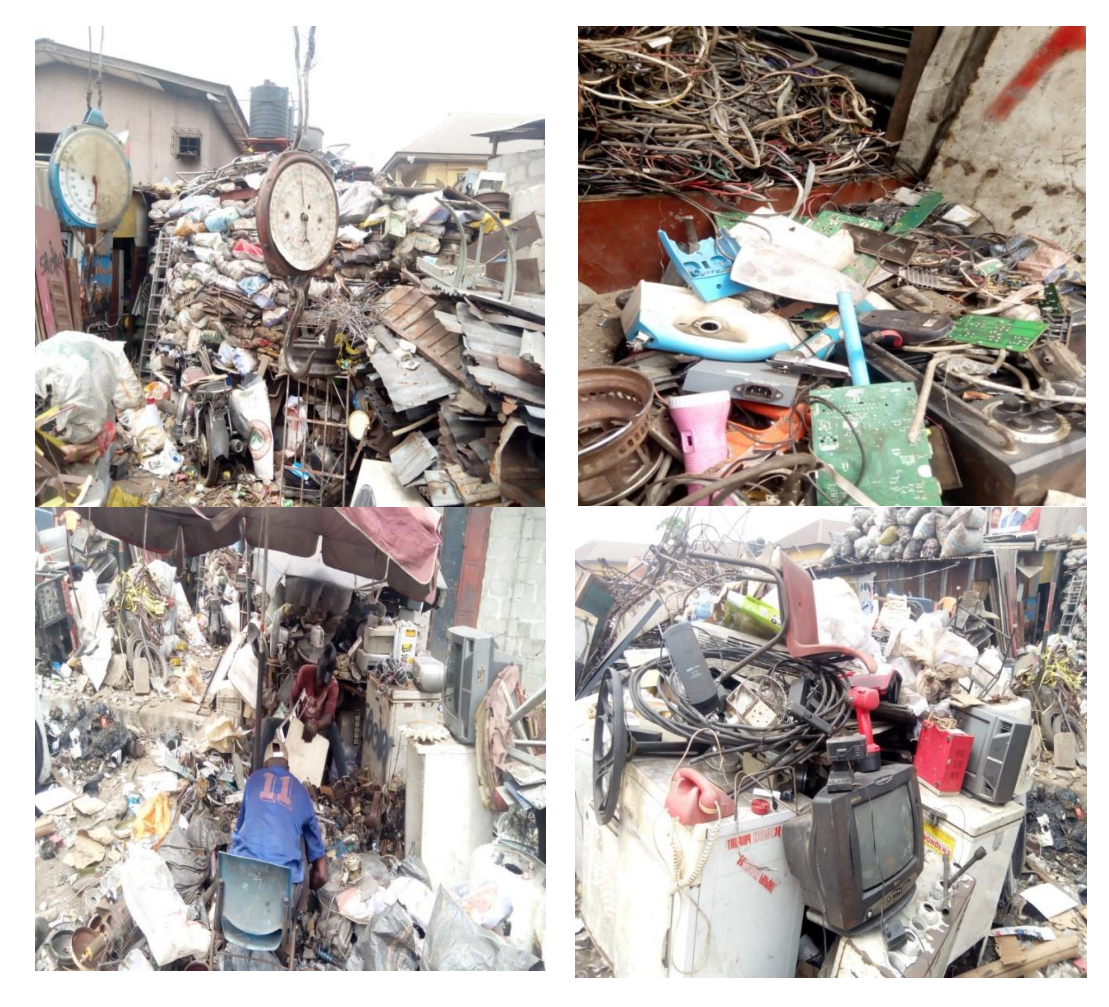
Fig. 1. Electronic waste dumpsite at Kaduna Street in Port Harcourt, Nigeria (Ibiene, 2020)

The pure bacterial isolates were identified on the basis of their morphological °c and biochemical tests. The pure cultures of the bacterial isolates were subjected to various morphological and biochemical characterization tests such as color, shape, elevation, consistency, margin, catalase test, MRVP (Methyl Red-Voges Proskauer test), fermentation of sugars, Kovacs citrate, indole, hydrolysis of starch and sensitivity tests. In order to determine the identity of bacterial isolates, results were compared with standard references of Bergey's Manual of Determinative Bacteriology [7].