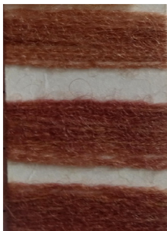
Fig. 3(b). Copper sulphate