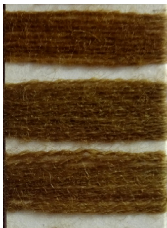
Fig. 3(a). Potassium aluminum sulphate (Alum)

Wool dyed with False Black Pepper dye using different mordants