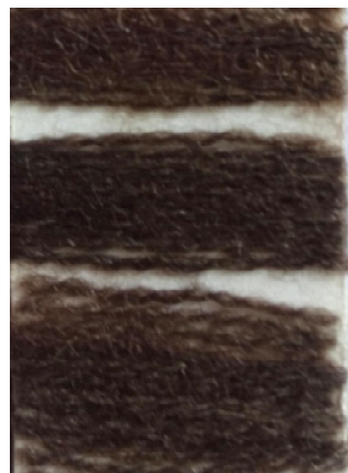
Fig. 3(c). Ferrous sulphate