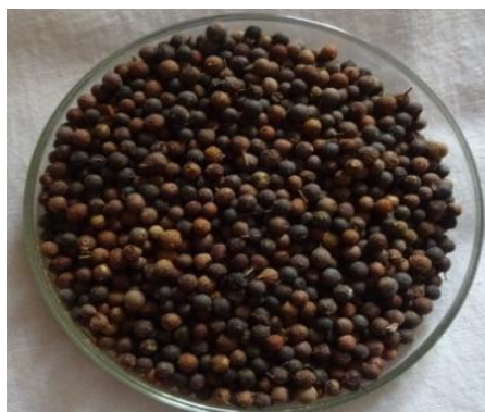
Fig. 1. False black pepper seeds

False Black Pepper seeds were a dye source for this study. The first step in creating a natural dye for wool or whatever you hope to add colour to, is to gather the plant material. [18] False Black Pepper seeds can be collected from plants. For the experiment the seeds were procured from the market, cleaned well and made into powder.