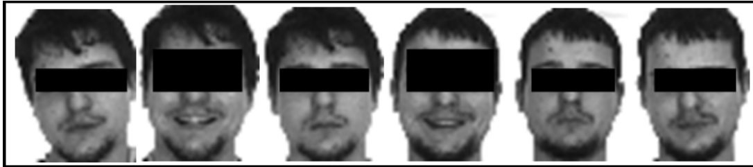
Fig. 1. A sample from AR-Face Database

Two different experiments are performed on this database. In the first one, the first three images are used for each person as the database. Then, each of the three images is used as the training image once and the remaining two images are used as the test images. The average of the recognition results obtained from these three experiments is given in Table 1. In the second experiment, database is constructed from the all six images of a person given in Fig. 1. As it is in the first experiment each of the six images are used as the training image once and the remaining five images are used as the test images then the average recognition result that belongs to the the six experiment, is given in Fig. 1.