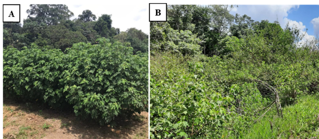
Figure 2. Caesar weed plants for seed production (A) and plants with branches broken by the wind due to the fragility of the plant architecture (B)

Regarding crop management, branch breakage was observed by the action of the winds (Figure 2), pointing to the need for a study to evaluate pruning management during the crop cycle, as a way of improving the plant architecture, avoiding breaks, and increasing the number of reproductive side branches (Verdin et al., 2019).