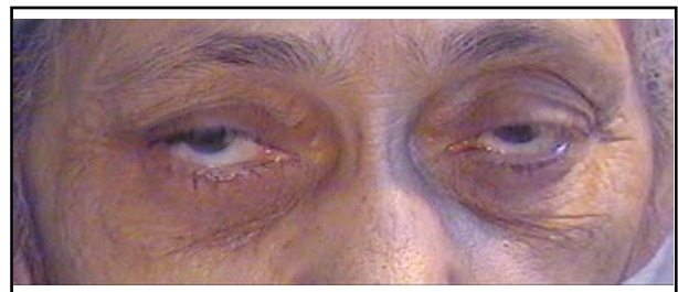
Fig.3: Photograph of The Patient One week After Injection.

Benign essential blepharospasm is usually misdiagnosed by the general practitioners and the patients are treated with partially effective or ineffective remedies like anxiolytic or sedative agents. A very small percentage of cases is able to get the advice of the desired physician or