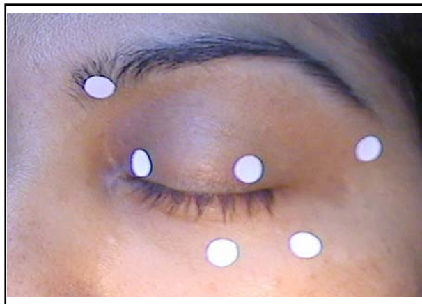
Fig.4: Usual Sites of Injection for Botulinum Toxin.

ophthalmologist who can manage the disease properly.