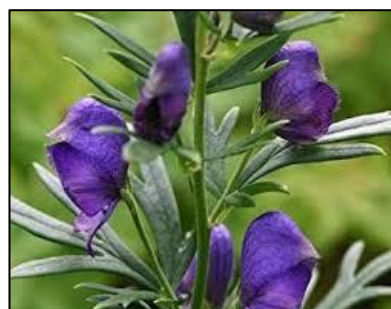
Fig. 1. Image of the plant Aconitum heterophyllum . It is used in many Asian traditional medicine preparation; It belongs to the family Ranunculaceae

plant Aconitum heterophyllum has been elaborated that includes, the taxonomic classification of the plant, the morphological description of the Aconitum heterophyllum as in Table 2 and Table 3, the mode of cultivation of Aconitum heterophyllum , the pharmaceutical roles of Aconitum heterophyllum as detailed in Table 4, Amelioration of Castor Oil-Induced Diarrhoea by administration of Aconitum heterophyllum , Amelioration of Castor Oil-Induced Intestinal Fluid Accumulation by administration of Aconitum heterophyllum , Evaluation of the Antibacterial role of the Ethanolic extract of Aconitum heterophyllum . The objective of providing the entire gamut of the classification till the Anti-bacteria role of Aconitum heterophyllum is to ensure awareness of this plant that maybe used for treatment of myriad medical issues.