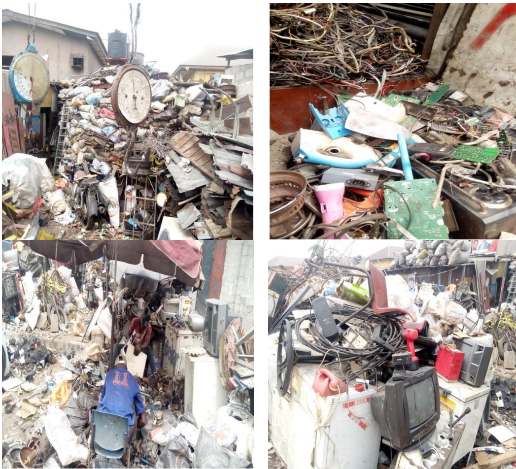
Fig. 1. Electronic waste dumpsite at Kaduna Street in Port Harcourt, Nigeria (Ibiene, 2020)

The pure bacterial isolates were identified on the basis of their morphological °c and biochemical tests. The pure cultures of the bacterial isolates were subjected to various morphological and biochemical characterization tests such as color, shape, elevation, consistency, margin, catalase test, MRVP (Methyl Red-Voges Proskauer test), fermentation of sugars, Kovacs citrate, indole, hydrolysis of starch and sensitivity tests. In order to determine the identity of bacterial isolates, results were compared with standard references of Bergey's Manual of Determinative Bacteriology [7].