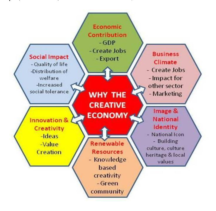
Fig. 2. The importance of creative economy

This is to consider in the implementation of the linkage model is the determination of the location of outlets that must be cultivated in strategic places and close to the tourist spots. For example is the batik industry in Kampung Laweyan, Solo Central Java. Tourists can see the process of making batik, and after seeing the process of it tourists can visit batik sales outlets to buy batik as a souvenir.