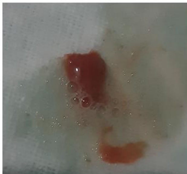
Fig. 5. Clots from sputum