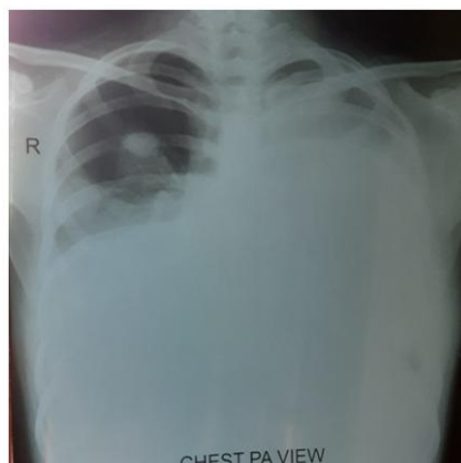
Fig. 2. Pneumothorax in right and left lung