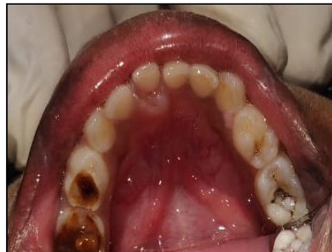
Fig. 2. Occlusal view of mandible