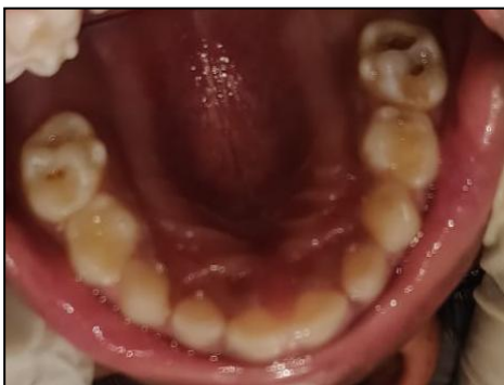
Fig. 1. Occlusal view of maxilla

Because there is a decrease in the degradation of these molecules, more subcutaneous mucopolysaccharides, or glycosaminoglycans, are accumulating which causes the lips and tongue to thicken. The standard method for treating hypothyroidism is thyroxine replacement therapy (levothyroxine sodium). In the peripheral tissues, thyroxin (T4) is changed into triiodothyronine (T3), which has a higher metabolic activity. Patients are then returned to a biochemically normal thyroid state with normal TSH and serum-free T4 levels (FT). The patient's TSH and FT4 levels are monitored for intervals of six months to a year after reaching the euthyroid condition. Within 6 months of starting thyroxine therapy, our patient's levels of T3, T4, and TSH improved [7-10].