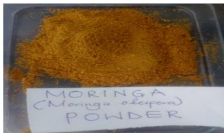
Moringa Leaf Powder