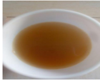
Reconstituted soup mix